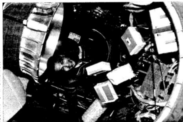
Sheikh Muszaphar Shukor at the ISS

The guideline not only gives advice for Muslim religious practice but also articulates the main features of Islamic ethics in outer space in the section entitled "etiquette of travelling" which states that the Muslim astronaut should maintain his relationship with God, sustain "harmoni-