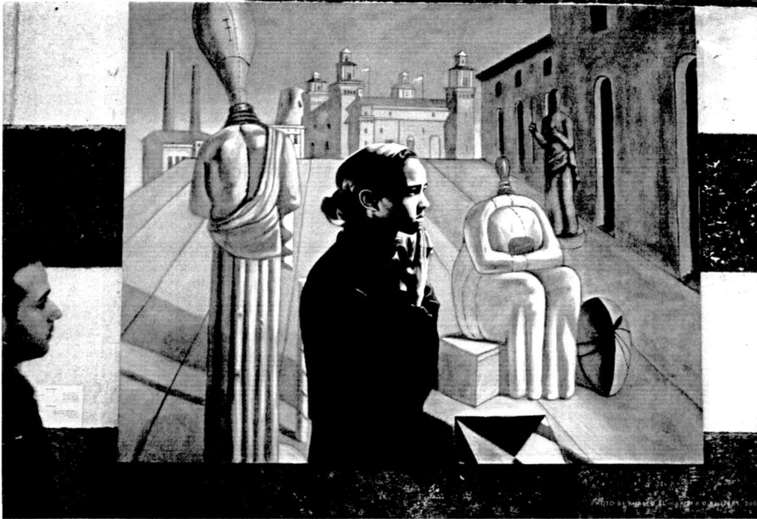
"The Disquieting Museum" by Ali Haseoun on display in Damascus, 2008

for the study of islam in the modern world